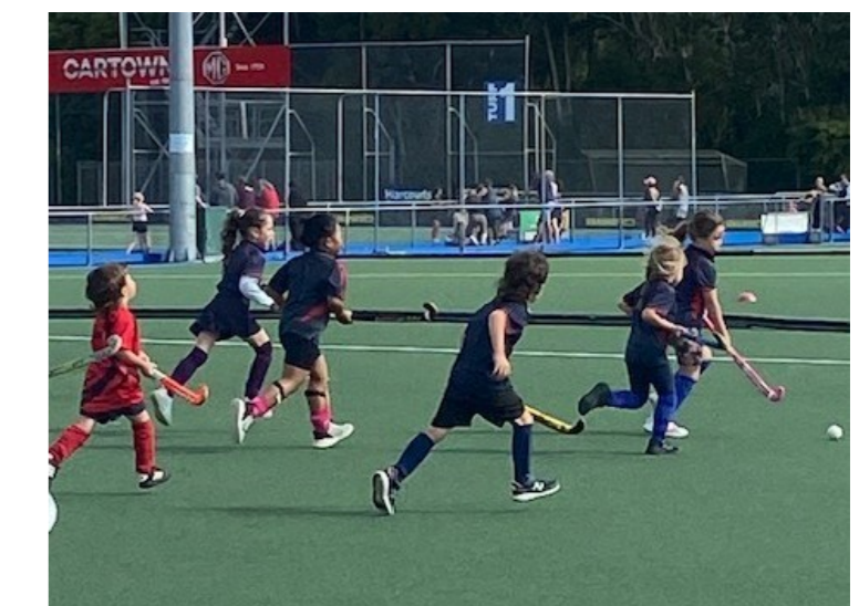
At the top we see our students using cones and crates during their breaktimes, working together as part of creative play. Below that we see our Junior hockey players all running around showing great determination at Summer hockey!